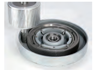
Metal gear drive